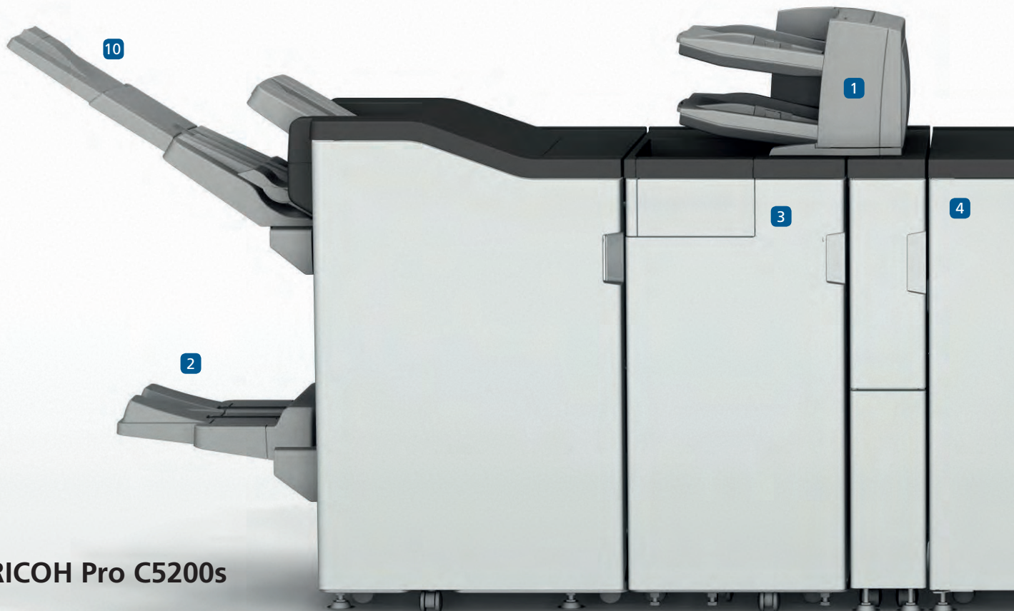
RICOH Pro C5200s