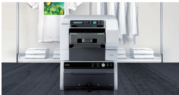
* RICOH Ri 100 printer with the RICOH Rh 100 finisher option.

The RICOH Ri 100 can fit into a space as small as 399 x 698 mm, making it one of the smallest DTG printers. The printer and its finisher can be stacked to maximize functionality without sacrificing space.