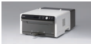
RICOH Rh 100 Finisher