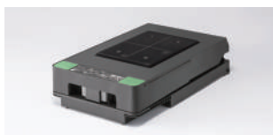
RICOH Tray for Small Size Type 1 (A5)