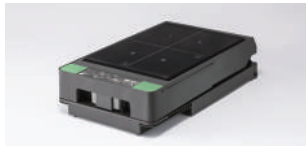
RICOH Tray for Standard Size Type 1 (A4)