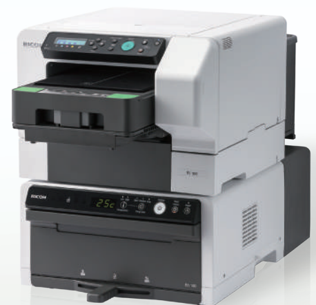
* RICOH Ri 100 printer with the RICOH Rh 100 finisher option.